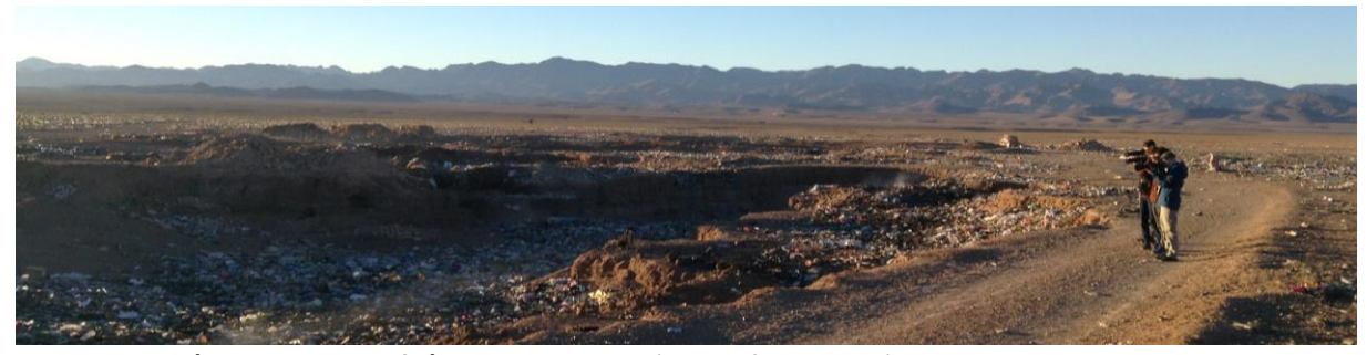
Tagdilt Track (Boumaine Dadès) , 31.364, -5.960 (start of the Track) until somewhere here 31.316, -5.918: Red-rumped Wheatears, Desert Wheatears, Temminck's Larks, Bar-tailed Larks, Pin-tailed and Black-bellied Sandgrouse, Thick-billed Lark, Cream-coloured Courser, Whinchats etc.

Imider (Boumalne Dadès) , 31.370, -5.821: Pharao Eagle Owl, Montagu's Harrier, Pin-tailed Sandgrouse, Black-eared Wheatears, Thick-billed Larks, Lanner Falcon, Great Grey Shrike, Desert Wheatear, Long-legged Buzzard.